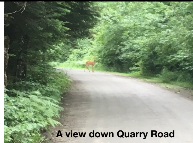
A view down Quarry Road