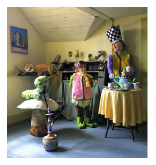
Alice in Wonderland workshop scene – papier mâché

One of her series was called "A Portrait of a Village" with the focus being on people in their particular setting, whether it be sugaring or reading a book. Another series was "Vermont Country Stores", done for a display at a Visitor Center.