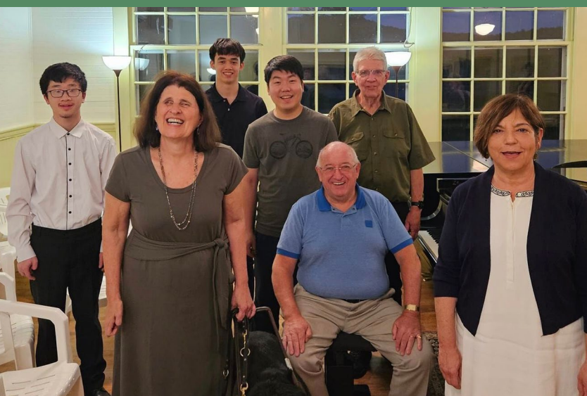
Performers who played on the opening concert of the 2023 season at Adamant.