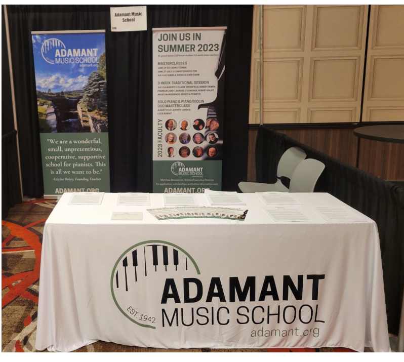
Adamant Music School booth at the Music Teachers' National Association 2023 Conference in Reno, NV