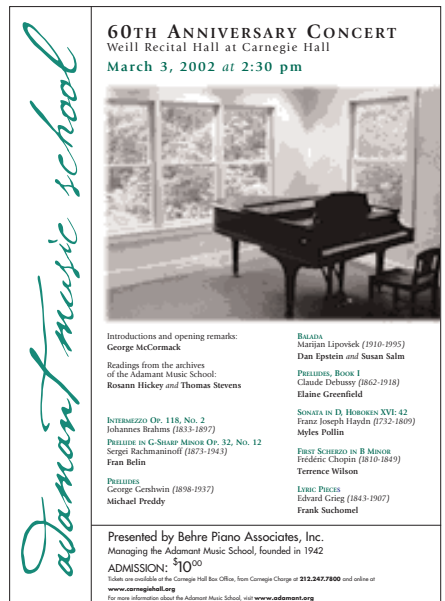
The poster for this year's concert at Weill Recital Hall