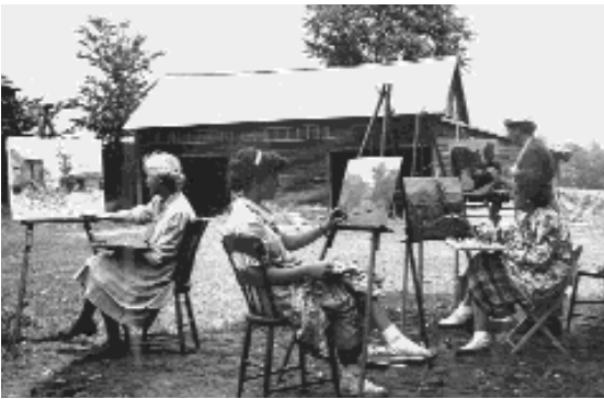
An art class at the Weed Farm in the late 1930s

the continuous killings by Stalin in Russia, and the Japanese firebombing of Shanghai.