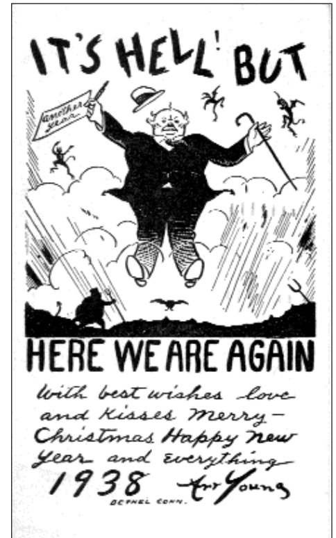
Cartoonist Art Young's 1938 holiday card